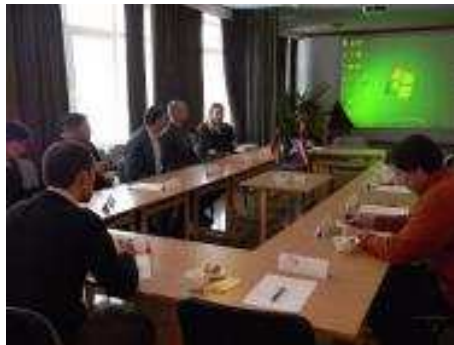
Round table discussions 13.12.2012.