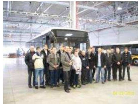
WP2 Training for students in Jelgava (2013, March)