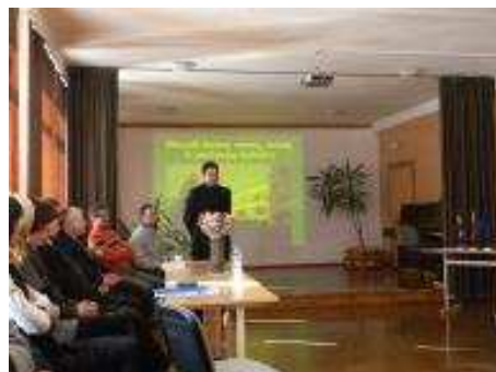
Round table discussions 21.02.2013

Organized Cross border meeting in Skuodas 25.01.2013.