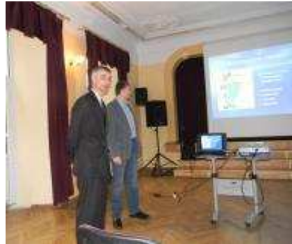
Meeting in Saldus school 28.11.2012.