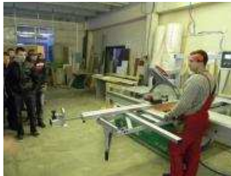
Visits to enterprises - November-December, 2012