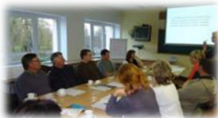
WP2: Round table discussion with employers 13/11/2012