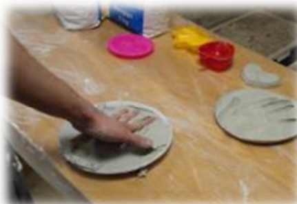
WP4: OPEN DAY «PROFESION DAY» 09/04/2013