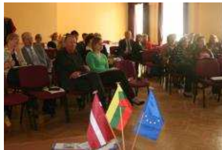
Project Steering group and Working group Meeting in Saldus. 08.05.2012.