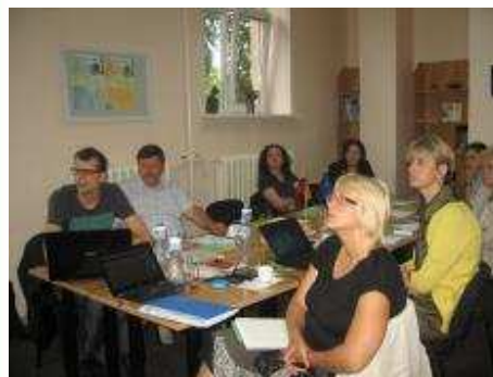
Meeting to agree on research and cooperation model elaboration joint methodics . 05.07.2012. in Panevėžys